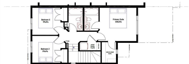
UNIT SQFT - UPPER 630sq ft